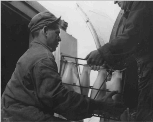
Harry S. Truman Library and Museum