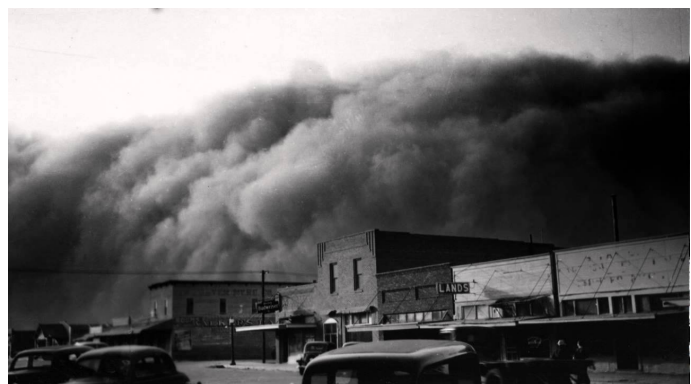
Above: Kaiser Wilson Poster Above Right: Standard Oil Cartoon Right: Dust Bowl Photograph