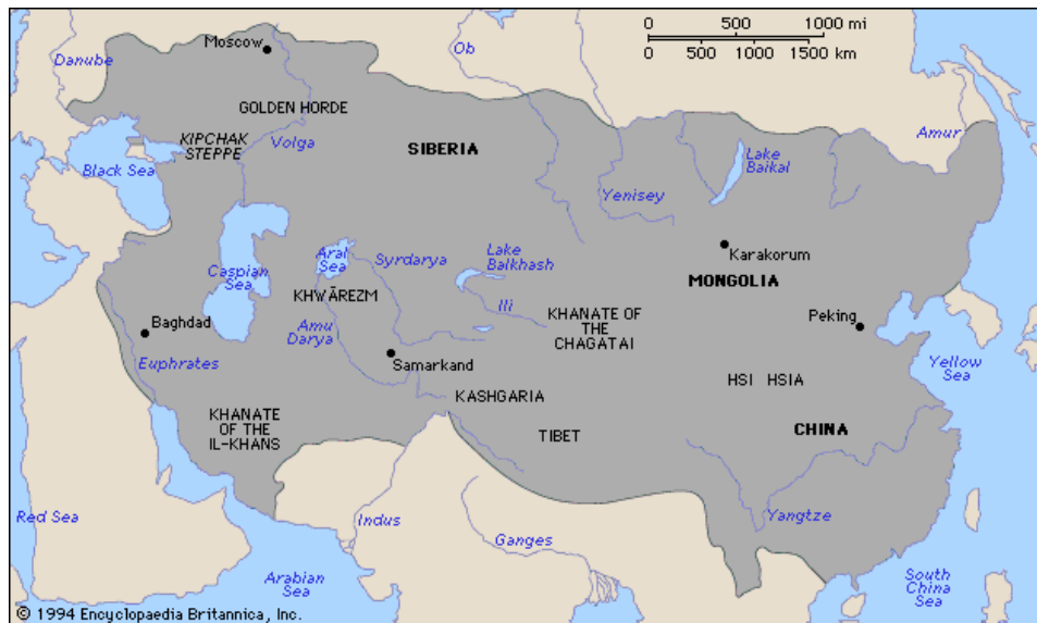
The extent of Mongol Conquests 1294.

1. What continent is the Mongol Empire located? _____